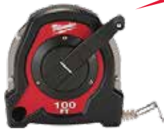
100ft Closed Reel Long Tape