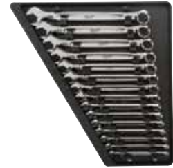
15-Piece Combination Wrench Set - Metric