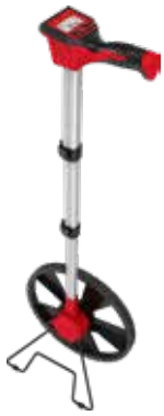
12" Digital Measuring Wheel