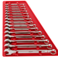
15-Piece Combination Wrench Set - S.A.E