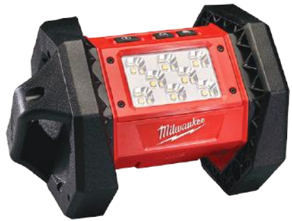
M18<sup>™</sup> ROVER<sup>™</sup> LED Flood Light