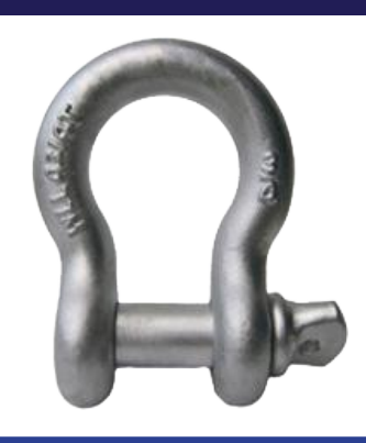
Design Factor: 6:1