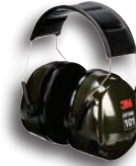
MMM7A Over-the-Head (NRR 27dB)