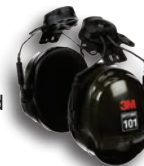
MMM7P3E Cap Mounted (NRR 24dB)